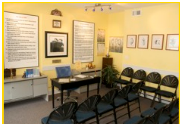
Front Meeting Room