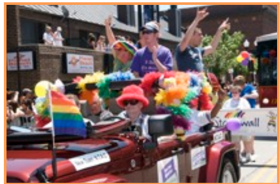
NTAC, Chicago Pride 2009