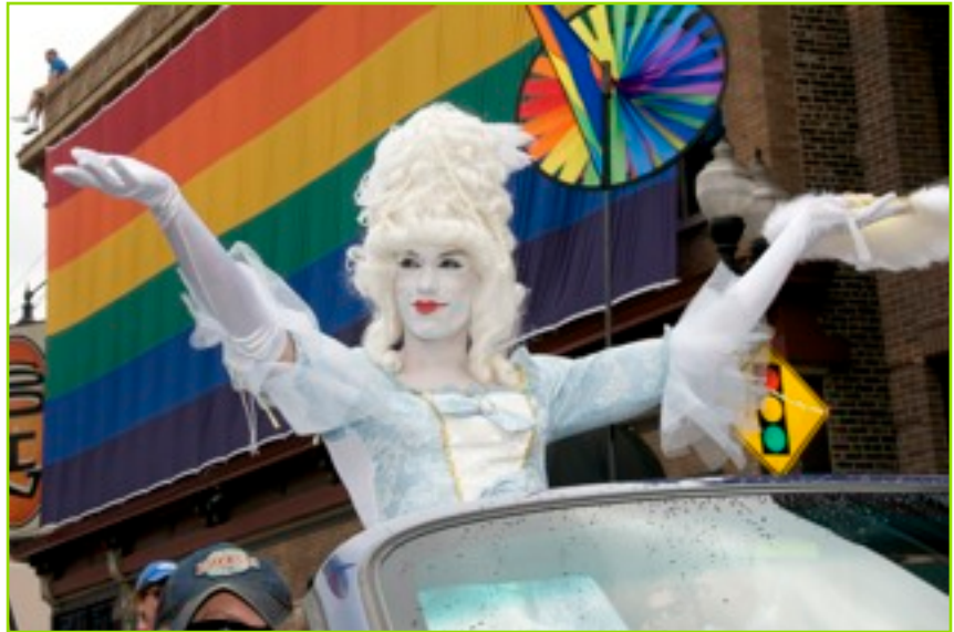
Miss New Town, Chicago Pride 2008

“People of all sexual preferences struggle. But sometimes because of ignorance, people are not given an equal opportunity to succeed. Here at New Town, we’re all equal. We all get the opportunity to live a clean sober life. New Town opens its doors to us without any bias.”