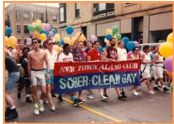
NTAC, Chicago Pride 1980

Sustaining this type of recovery community inevitably leads to a stronger neighborhood, city and society.